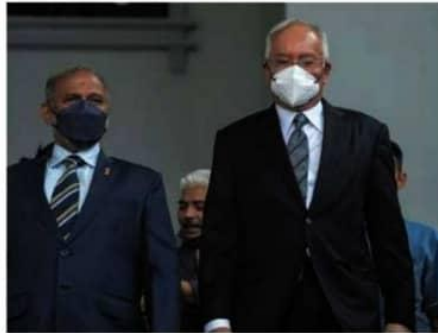
Hearing to resume: Najib (right) arriving at Kuala Lumpur Courts Complex.