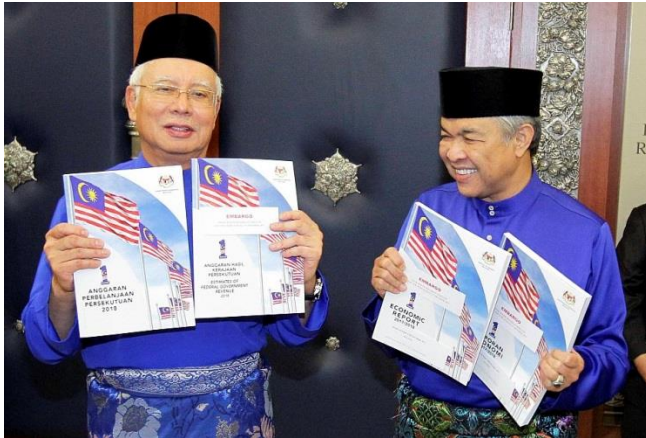
Prime Minister Datuk Seri Najib Tun Razak with Deputy Prime Minister Datuk Seri Zahid Hamidi holding the Budget 2018 report after tabling it in Parliament on Friday.