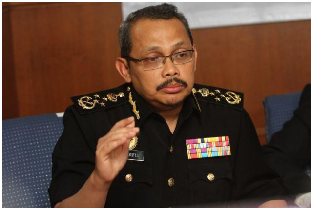
Tan Sri Dzulkifli Ahmad.

According to Dzulkifli, he has contacted Inspector-General of Police (IGP) Tan Sri Mohamad Fuzi Harun regarding the matter and the police are set to take further action.