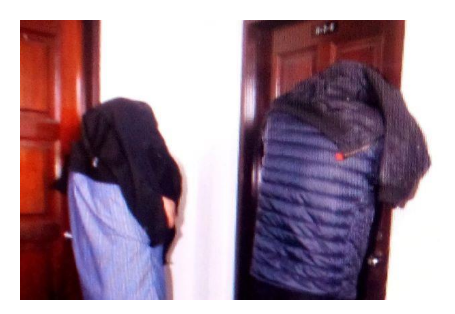
The Sabah Water Dept director (right) and his deputy outside the Magistrate's court in Kota Kinabalu

KOTA KINABALU: Two senior officers of the Sabah Water Department and two others have been remanded to facilitate investigations into alleged kickbacks involving RM3.3bil worth of federal projects.