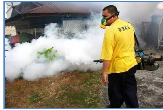
All out war: Fogging being carried out to stop the dengue epidemic.

spokesperson when asked to comment on Health Minister Datuk Liow Tiong Lai's statement yesterday that local authorities can break into vacant property suspected to breed mosquitoes to carry out fogging. "First, we have to make sure the particular house is indeed vacant. This we will need to check with our Valuation Department to identify the home and the owner.