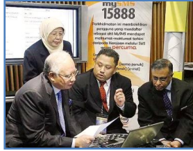
Tech talk: Najib getting an insight into e-filing from the IRB's team after launching the Electronic Services Campaign yesterday. On the right is Second Finance Minister Tan Sri Nor Mohamed Yakcop.

Najib said corporations would enjoy tax relief worth RM1.5bil as announced in the mini budget and this was aimed at spurring more activities to boost the economy. "The Government still needs revenue not only to generate economic growth but also for expenses. There are salaries to be paid, pensions to be released and at the end of the year, people are hoping for bonuses.