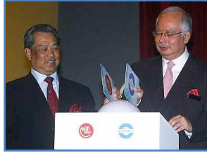
Joint effort: Najib (right) and Muhyiddin inserting cards to officially launch the MIDF symposium and SME book in Kuala Lumpur yesterday.

“In facing the economic crisis, we have to ensure that the financial system and banking sector can channel out loans and credit to businesses and entrepreneurs. As long as they cannot do that (ensure availability of credit), we will not be able to ensure the economy recovers,” he told reporters.