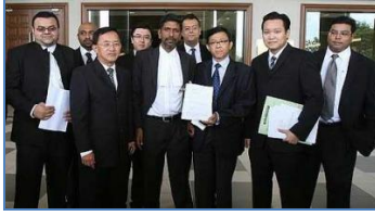
Legal team: Ong's lawyers gathering at the Kuala Lumpur Court before filling a RM500mil suit against Tiong Monday.