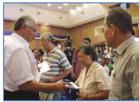
Reaping the rewards: Najib presenting Risda dividends to recipients in Pekan Sunday.

PEKAN: Risda, Felcra and Felcra should form a business consortium to carry out critical downstream activities, said Prime Minister Datuk Seri Najib Tun Razak. He said he was confident that the three agricultural agencies could multiply their profits and eradicate poverty by working together. "The three remain separate but the projects can be carried out together through a consortium," said Najib, adding that discussions on setting up the consortium would begin soon.