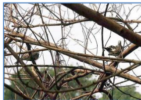
Sweet songs: The land is home for many species of birds.