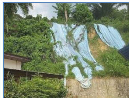
Interim measure: The slope has also been covered with plastic sheets.

A landslide just above the Malaysian Association for the Prevention of Tuberculosis (MAPTB) building in Kuala Lumpur last August has prompted stabilisation work to be carried out. The hillslope, part of Bukit Petaling, also houses the Kwong Tung Chinese cemetery. At the site, at Lorong Syed Putra Kiri, blue plastic sheets were seen covering the hillslope. According to some of the centre’s employees, a drain has been constructed and since the incident, no landslides have occurred despite heavy rain on several occasions.