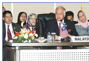
Manado summit: Najib speaking on sustainably exploiting the marine resources in the region at the CTI summit at the Dewan Grand Kawanua in Manado yesterday. Also present is Science, Technology and Innovation Minister Datuk Dr Maximus Ongkili (left).

The CTI summit which was launched here yesterday saw leaders of the six CTI countries — Indonesia, Malaysia, the Philippines, Papua New Guinea, Solomon Islands and Timor Leste — gathering to commit themselves to protecting the area's marine biodiversity.