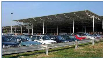
Bigger and better: More parking bays are available at the expanded LCCT.