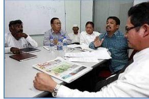
Squatter's condition: Representatives of Bukit Botak squatters and their lawyer at a meeting Delpuri Corporation representatives to state their terms yesterday.