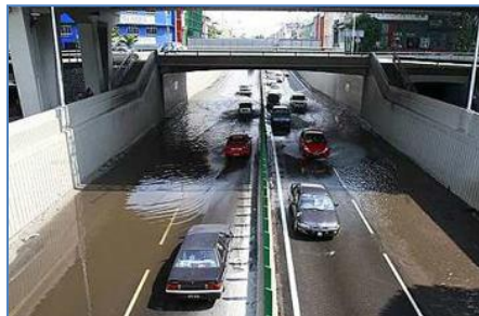
Under water: The underpass was still flooded (above) as the pumps failed to clear the water, leading to a massive gridlock.

The pumps are used to flush out rain water from low-lying areas. City Hall corporate communications manager Anwar Zain said the pump house had three pumps to draw away water from the underpass during flash floods. "Pump houses are placed at low areas, especially underpasses, and the DBKL has 16 pump houses located at various parts in the city," he said.