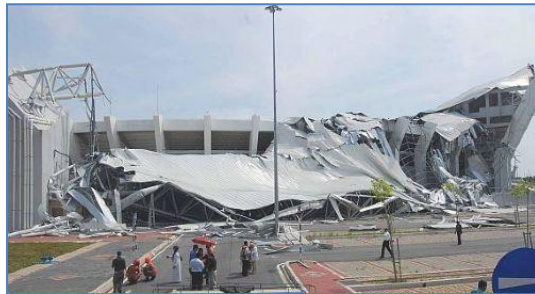
The roof of the Gong Badak Stadium collapsed on Tuesday morning. - 2 June, 2009.