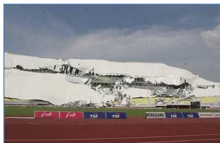
A view of the collapsed section of the roof from the track of the Gong Badak stadium. - 2 June, 2009.