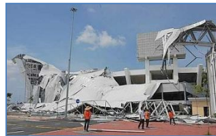
Damaged: Workers looking at the collapsed structure of the RM300mil Sultan Mizan Zainal Abidin Stadium in Gong Badak, Terengganu. The affected zones are the main entrance, royal podium and the public seating area.