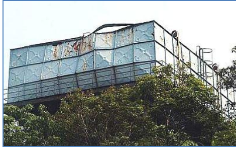
Alarming state: The water tank at Taman Cantik in Cheras.

“This is a total disregard of public safety. In fact, just below the tank on the grassy area, an underground cavity four feet deep has formed while the soil is also giving way with half a foot width of gap between the cemented platform and the earth surface. “The water that is continuously dripping down is also weakening the floor,” he said.