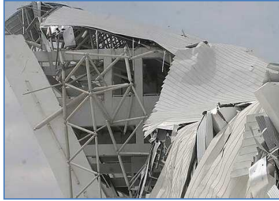
A view of the collapsed section of the Gong Badak stadium. - 2 June, 2009.