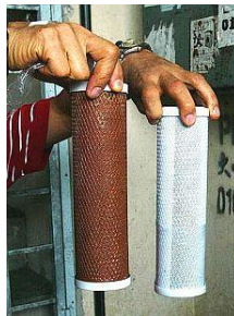
Filthy: The filter on the left used by a resident shows the level of the dirty water supplied to the area.

Meanwhile, over the last two years till now, the residents have been complaining about murky, yellowish water and sometimes go without water supply a few times a week. It is evident that after nearly 40 years since the structure was constructed, the wear and tear has taken a toll on the tank, and is in turn affecting the quality of the water. The residents said their numerous complaints to the water concessionaire had fallen on deaf years.