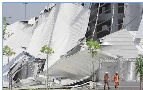
A view of the collapsed section of the Gong Badak stadium. - 2 June, 2009.