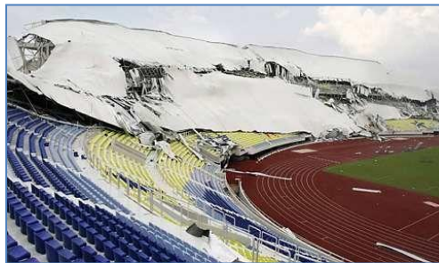
A view of the collapsed section of the roof from the track of the Gong Badak stadium. - 2 June, 2009.