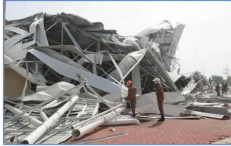
Firemen inspecting the collapsed roof at the Gong Badak stadium. - 2 June, 2009.