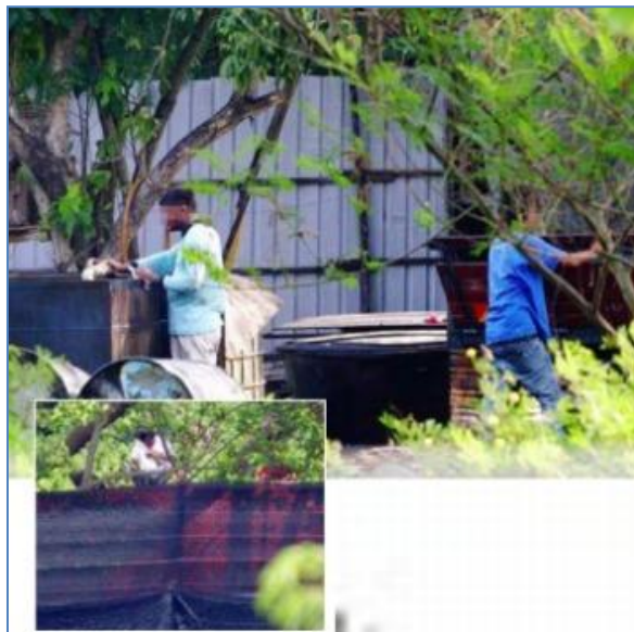
Oil thieves at work: Workers transferring oil from a stationary tank into a small lorry at the 'depot' in Jalan Rantau Panjang in Klang, while inset shows a worker sitting on top of a tanker with black netting obscuring the view of passing motorists from watching the siphoning activities.

Crude palm oil is mainly exported for production of items such as cooking oil, non-dairy creamer, condensed milk, butter and margarine. Statistics provided by the Malaysian Palm Oil Board revealed that the thefts costs the industry RM325mil in losses in 2008. With the crude palm oil price averaging at RM2,600 per tonne now, the extent of losses is this year expected to match last year's figure. Over 20 transporters are said to be operating 1,500 tankers moving crude palm oil. Most people do not suspect anything amiss when they see tankers going off the road and heading to "depots" in plantations or villages, where the siphoning takes place.