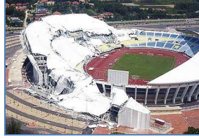
Declared unsafe: The Sultan Mizan Zainal Abidin Stadium after its roof collapsed yesterday.