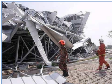
Firemen inspecting the collapsed roof at the Gong Badak stadium. - 2 June, 2009.