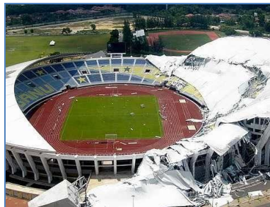
Gong Badak stadium roof collapses – Aerial view of the collapsed roof of the Gong Badak stadium. - 2 June, 2009.