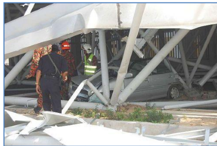
Firemen inspect a badly damaged car at the Gong Badak stadium. - 2 June, 2009.