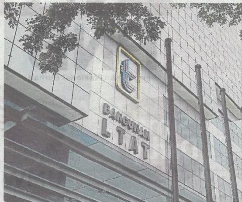
The Armed Forces Fund Board says the acquisition of the Boustead Plantations Bhd stake by Kuala Lumpur Kepong Bhd will contribute to its investment portfolio diversification.

"As a retirement fund, diversification helps reduce risk and enhance stability by decreasing