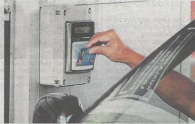
A motorist paying toll with a Touch 'n Go (TnG) card. Last Monday, the government said it would review TnG monopolies. FILE PIC

The prime minister was asked on the announcement by Putrajaya that it would end the decades-old monopoly of Puspakom — the sole company appointed by the government to conduct mandatory inspections on both commercial and private vehicles — next year. Puspakom was established in 1994.