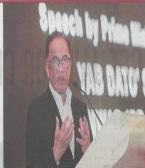
Prime Minister Datuk Seri Anwar Ibrahim at the Real Estate and Housing Developers' Association's 50th anniversary dinner in Petaling Jaya on Wednesday night.

tify the major project to which he was referring.