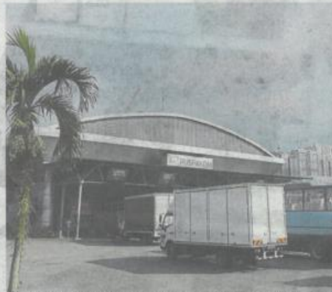
The Puspakom centre in Wangsa Maju, Kuala Lumpur. The Transport Ministry says it will allow qualified parties to provide vehicle inspections from Sept 1 next year, ending Puspakom's monopoly.

On Tuesday, the government announced that five highways nationwide would begin implement-