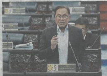
Prime Minister Datuk Seri Anwar Ibrahim says the Attorney-General's Chambers will review and ensure enforcement agencies don't investigate themselves.

It was previously reported that the IPCC would be in force starting July 1.