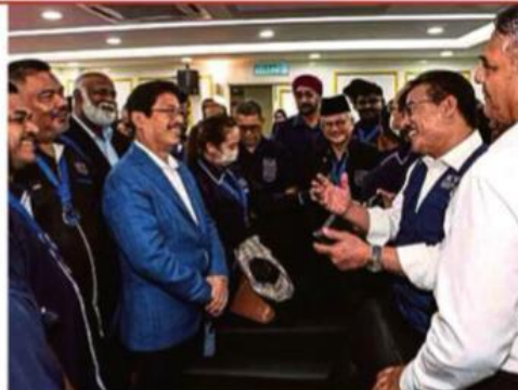
MACC Chief Commissioner Tan Sri Azam Baki (in light blue jacket) speaking to Malaysian Corruption Watch officials at the Malaysian Anti-Corruption Academy in Kuala Lumpur yesterday.

MACC Chief Commissioner Tan Sri Azam Baki said the matter