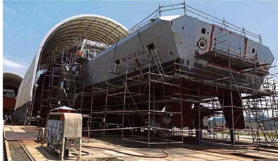
A littoral combat ship (LCS) under construction at the Boustead Naval Shipyard in Lumut, Perak, on Saturday. Minister in the Prime Minister's Department (Parliament and Law) Datuk Seri Dr Wan Junaidi Tuanku Jaafar says the government may establish a royal commission to investigate the LCS issue.

Earlier, the cabinet had proposed that the forensic audit report conducted in 2019 be declassified, but the process needed to