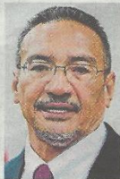
Datuk Seri Hishammuddin Hussein

"I will inform the cabinet about what we have done to ensure that this time things are on schedule," he said during the question-and-answer session at the Dewan Ne-