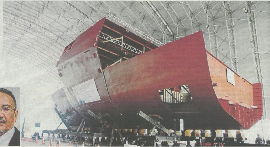
A littoral combat ship being constructed at the Boustead Naval Shipyard in Lumut in 2016.