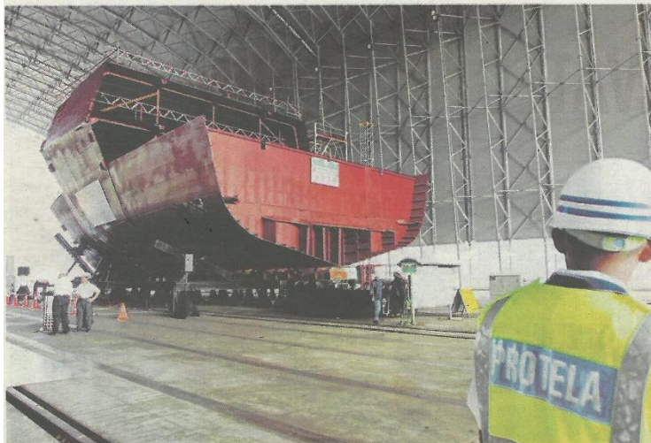
A Littoral Combat Ship being constructed at the Boustead Naval Shipyard in Lumut in 2016.