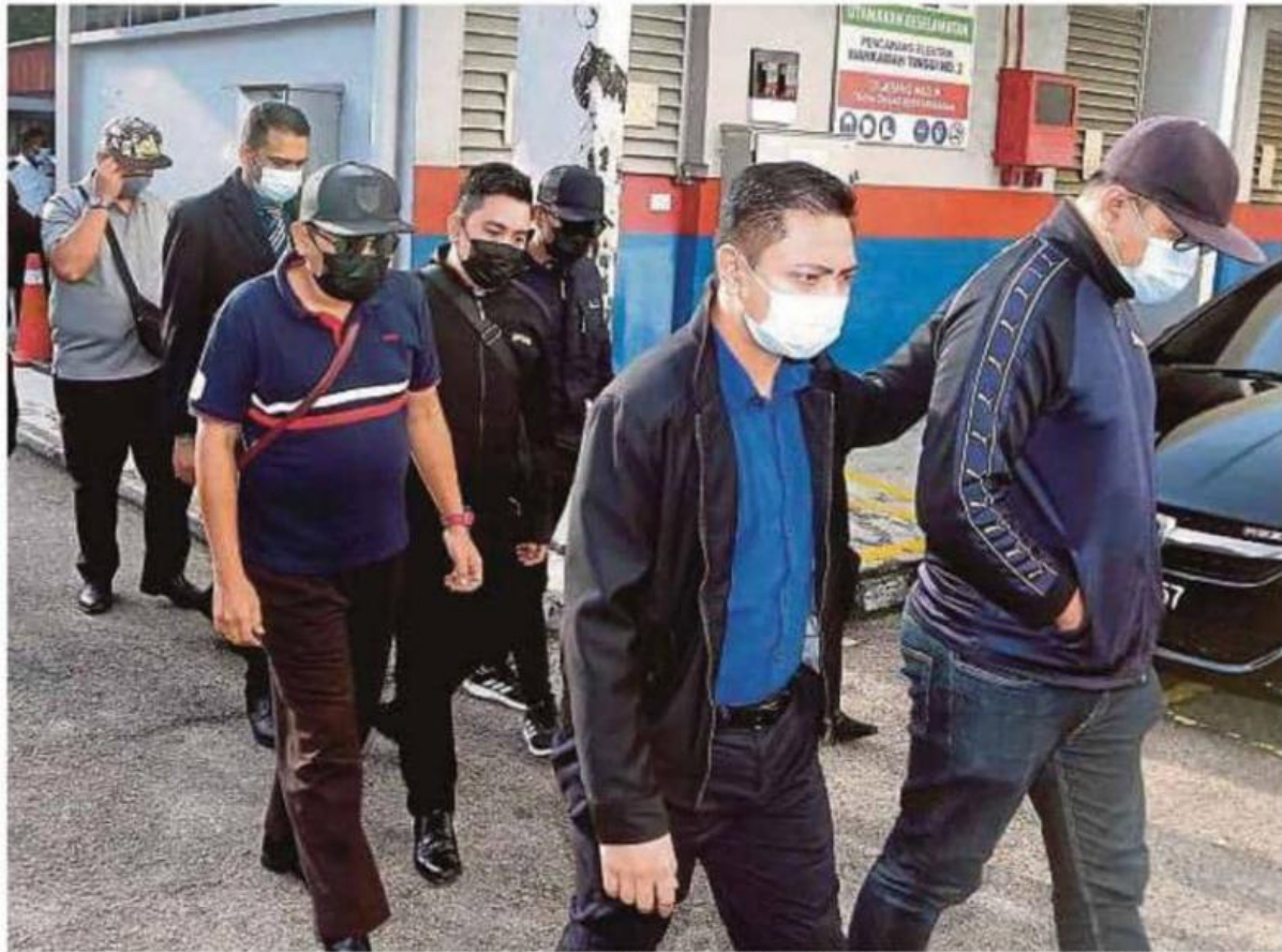
Four Malaysian Quarantine and Inspection Services Department enforcement officers arriving at the Johor Baru Sessions Court to be charged yesterday.