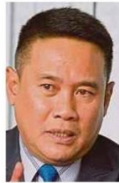
Datuk Seri Ahmad Khusairi Yahaya

The association welcomed calls for the setting up of a Royal Commission of Inquiry on the issue. Bernama