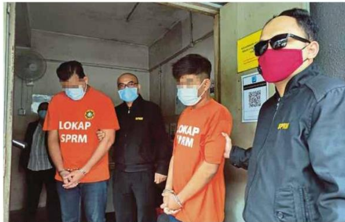
A Malaysian Anti-Corruption Commission (MACC) officer escorting the Malaysian Quarantine and Inspection Services Department officers out of the magistrate's court in Johor Baru yesterday.

The two, who were stationed at the Port of Tanjung Pelepas, Gelang Patah in Iskandar Puteri, near here, were detained at the