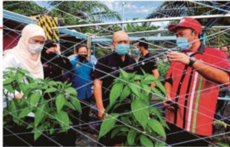
Agriculture and Food Industries Minister Datuk Seri Dr Ronald Klandee (centre) being briefed about chilli fertigation during his visit to the Kuala Langat Area Farmers' Organisation yesterday.

"These two companies are able to import meat in large quantities and are able to compete with