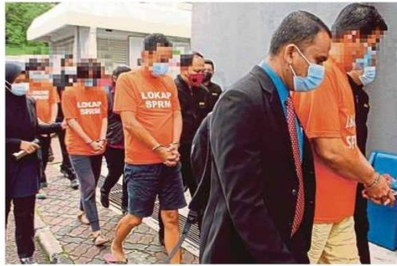
Four suspects of the meat cartel being brought to the Johor Baru magistrate's court to be remanded on Monday.

"The number of police reports over this issue has been accumulating over time," he said after unveiling a book on the history of the establishment of the Central Brigade and Battalion 4,5,6 and 19 of the General Operations Force at the APM Central Brigade Headquarters in Cheras here.