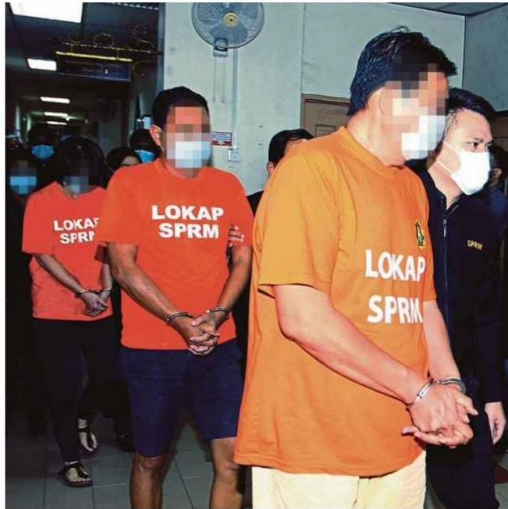
The meat cartel suspects being led to the magistrate's court in Johor Baru yesterday.