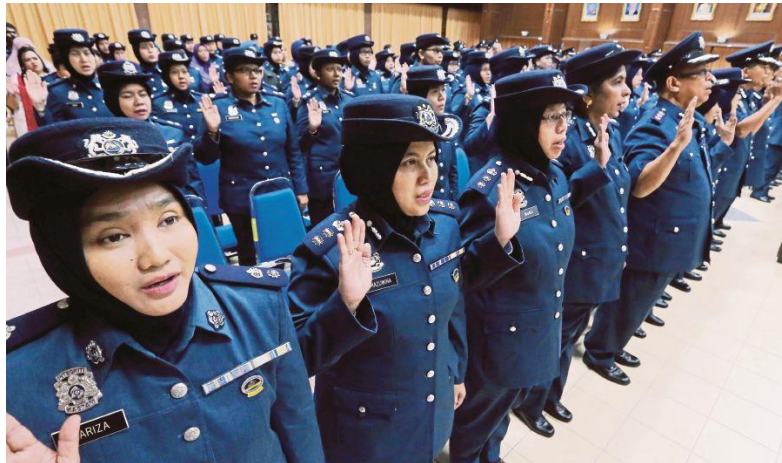
Perak Customs personnel taking the corruption-free pledge in Ipoh in March.

KUALA LUMPUR: THE Customs Department has put in place an almost airtight screening system to minimise chances of its personnel engaging in corruption.