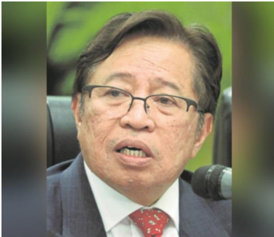
Datuk Abang Johari Abang Openg

KUCHING: Chief Minister Datuk Abang Johari Abang Openg is expected to announce a RM500 million fund to upgrade Internet speed in the state budget next year.