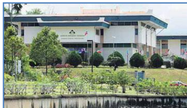
The RM24 million state Archives building that was built 25 years ago

KOTA KINABALU: A second government building has developed cracks barely five months after the Queen Elizabeth Hospital here was declared structurally unsound. The cracks inside and outside the State Archives building in Penampang Road are worrying staff and the public.