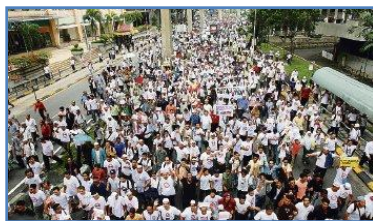
Some of the protesters who took part in the march from the National Mosque to Istana Negara on Saturday.