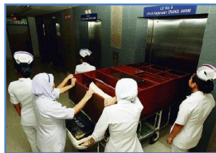
Nurses removing furniture from the Tower Block following its closure.

KOTA KINABALU: There was a time when patients slept on mattresses on the floor at the Queen Elizabeth Hospital Complex maternity ward.