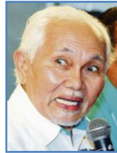
Tan Sri Abdul Taib Mahmud says the dams were needed for developmental purposes

KUCHING: Sarawak will go ahead with the construction of 12 hydropower dams in its interior, Chief Minister Tan Sri Abdul Taib Mahmud said yesterday.