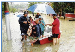
Several villagers from Kampung Mohd Amin in Johor Baru being evacuated after their homes were flooded yesterday.

JOHOR BARU: Several areas in Jalan Yahya Awal, Kampung Mohd Amin and Jalan Kolam Air here were flooded because of heavy rain.