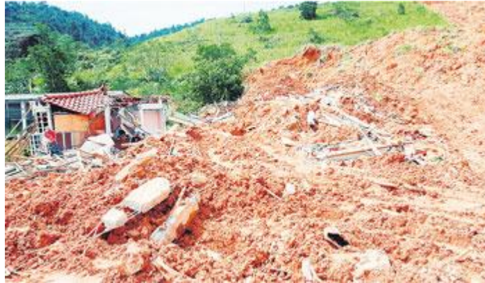
The site where the landslide occurred on Sunday is strewn with debris.