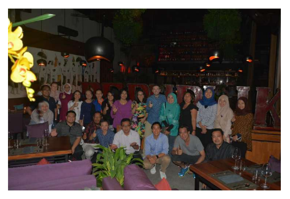
Appreciation dinner to participants and secretariats