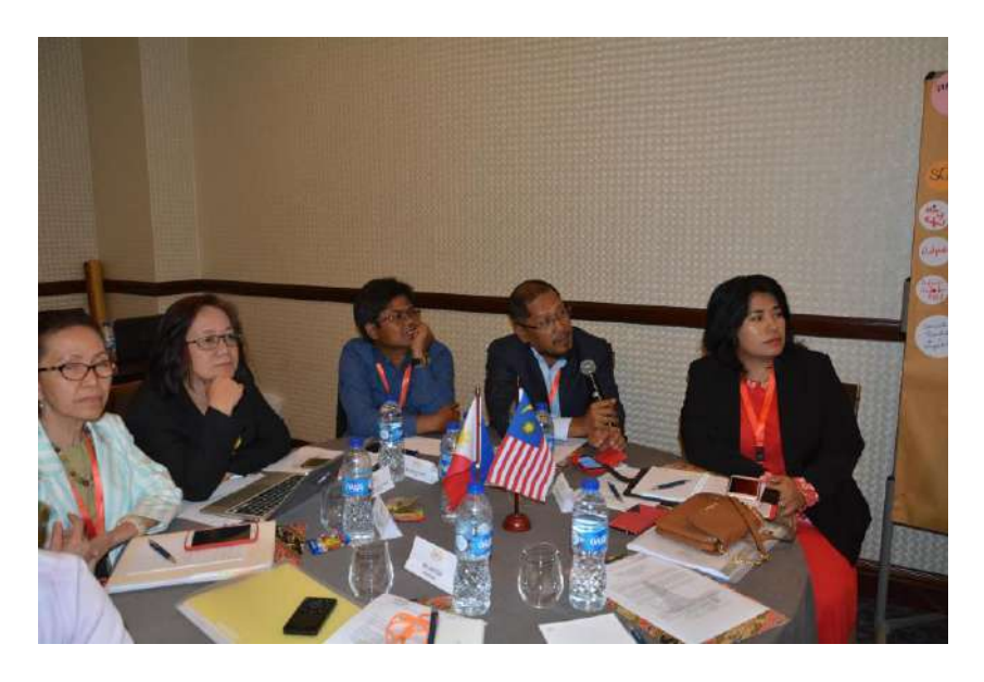
Participants discussing on the practicalities of the new Strategic Plan

After 03 days of effective working (16 – 18 February 2017), with GIZ facilitators and experts' active support, the SPC members basically